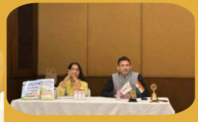
It provided great insight on the functioning of Rotary including the historical perspective