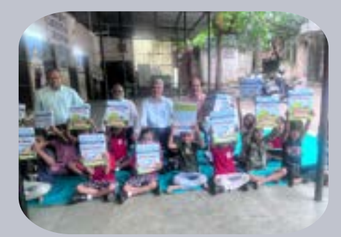
Beneficiary Schools: Nos: 99 Beneficiary Children : Nos 5000

Our members had the first hand opportunity of witnessing the joy, enthusiasm amongst the children who were receiving the workbooks. The members got the feed back from school teachers and principals that the work books are awaited by children and their teachers both as they are very very helpful in learn with fun activities